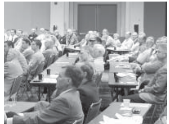
Conference participants enjoy informative sessions at the conference.